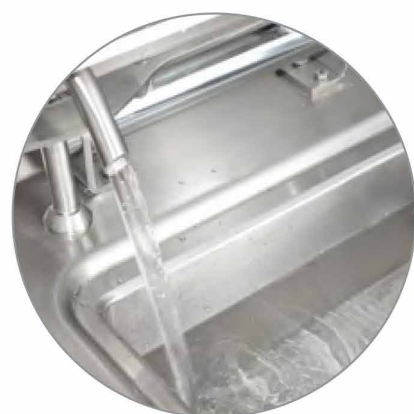
Automatic water filling with litre programming.