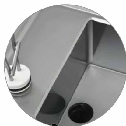
Water drain with overflow. Waterlight plug to empty the food onto a removable container.