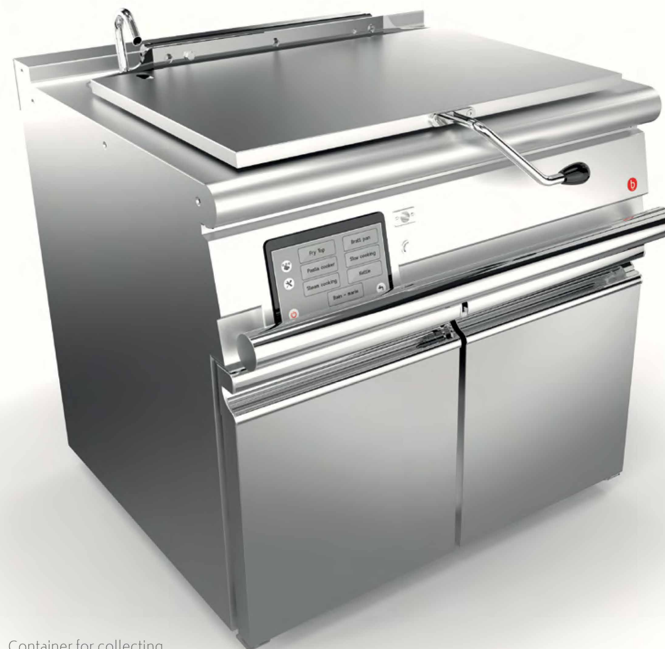
Container for collecting food cooked in the pan. Guarantee of work area cleanliness and easy product handling.