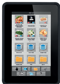
LCD 7" Touch Screen