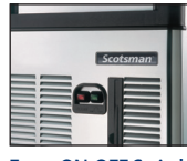
Front ON-OFF Switch Routine Maintenance Alarm