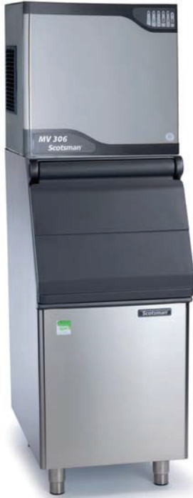
MV 306 with SB322 (sold separately)