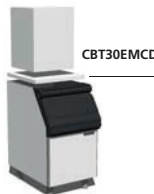
MV306+SB393+Top (sold separately)