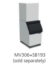
MV306+SB193 (sold separately)