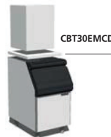
MV306+SB530+Top (sold separately)