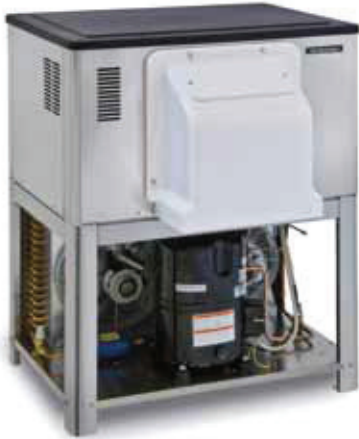
ABS Ice Chute Cover: sold separately.