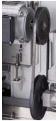
Pulleys & belt system allows to modify ice thickness