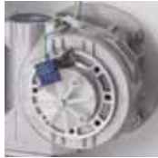
Gear box protection (hall effect)