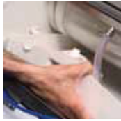
Easy to remove water sump