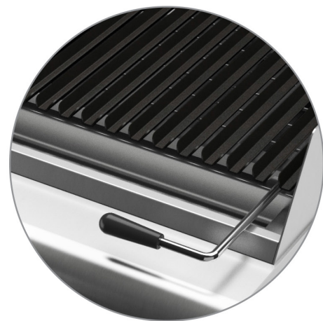
Distance from heat to grill plate is adjustable using side levers in order to provide different cooking temperatures.