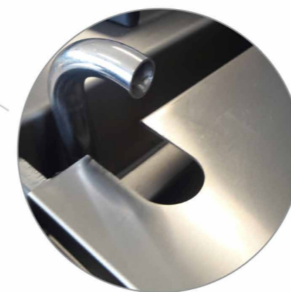
Automatic water-filling with a fixed tap located on the top.