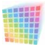
Rainbow Technology ® (Optional)

Particularly indicated to cool down "on the rocks" whisky, cocktails and aperitives.