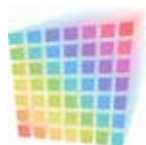
Rainbow Technology ® (Optional)

Eco-friendly versions in R290, 100% natural gas with zero environmental impact.