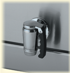
Large (2") chrome-plated brass drain valve.

Exceptional levels of reliability, hygiene and safety, all compliant with the strictest European regulations. Modern technology combined with the strength of AISI 304 18/10 stainless steel, with a Scotch Brite finish. Sober and elegant lines are the result of aesthetic research focusing on modern criteria in terms of ergonomics and functionality. This is the 'Settecento Baron' series: a professional kitchen, just 70 centimetres deep, that can be manufactured according to your exact requirements, without making any sacrifices and without any limits in terms of its composition. All of this plus the CE mark. Equipment designed and built to guarantee total safety as well as perfect hygiene with the utmost in energy efficiency.