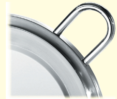
Extended stainless steel handle for safety.