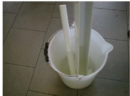
17. ....using different types of brushes clean/sanitize the water distributor tube and .....