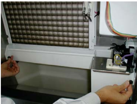
14. By lifting-up a little bit the back of the water reservoir, remove the same from its hook seats.