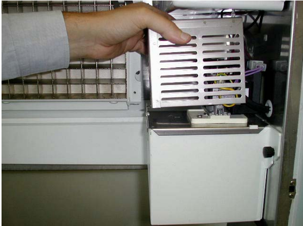
13. Unloose the two screws to remove the water reservoir