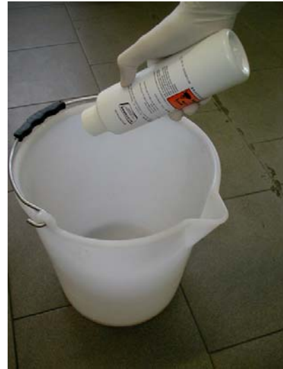
16. Soak into the bucket removed components and .....

NOTE. always follow approved Sanitizer/De-scaler manufacturers instructions and dilution when preparing Sanitizer/De-scaler solutions). Too concentrated cleaning/sanitizing solutions can cause corrosion on evaporator surface